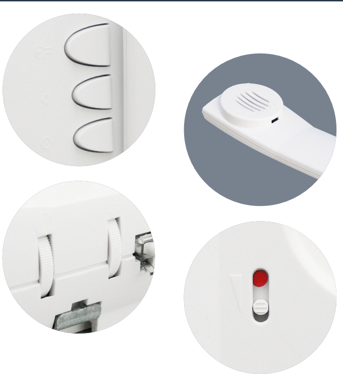
IMPORTANT NOTE: Urmet Domus S.p.A. reserves the right to change the features of the illustrated products without prior notice. This publication is not contractually binding.

1715/107 Handset with hearing aids capsule